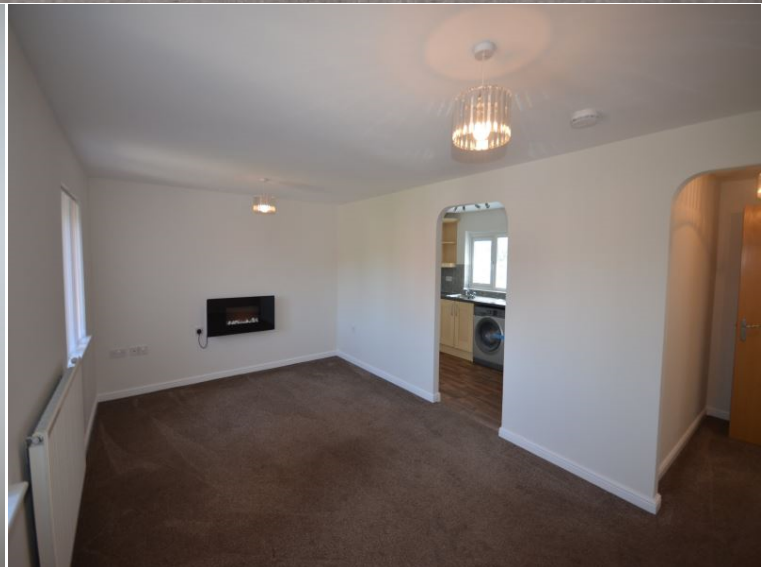
Cavalier Close , BRIDGWATER, Somerset, TA6 3WE

Rental £995 Monthly 2 Bedroom Coach House Available 12 June 2026