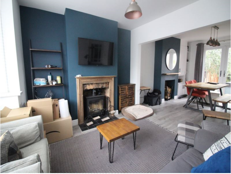
The Crescent Andover, SP10 3BL

Rental £1,400 Monthly 3 Bedroom End Terrace House Available 01 August 2024