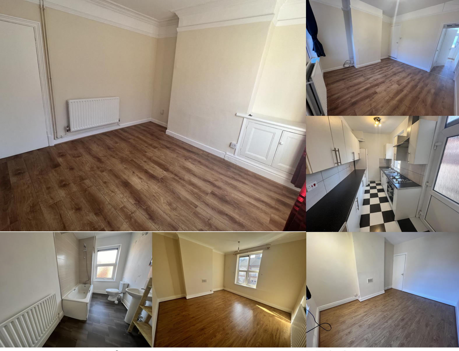
Wolverton Road, Leicester, LE3 2AJ