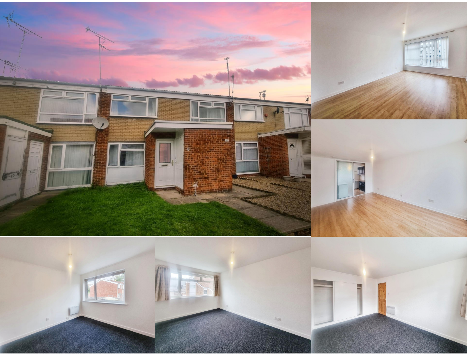
Denis Close, Leicester, LE3 6DQ