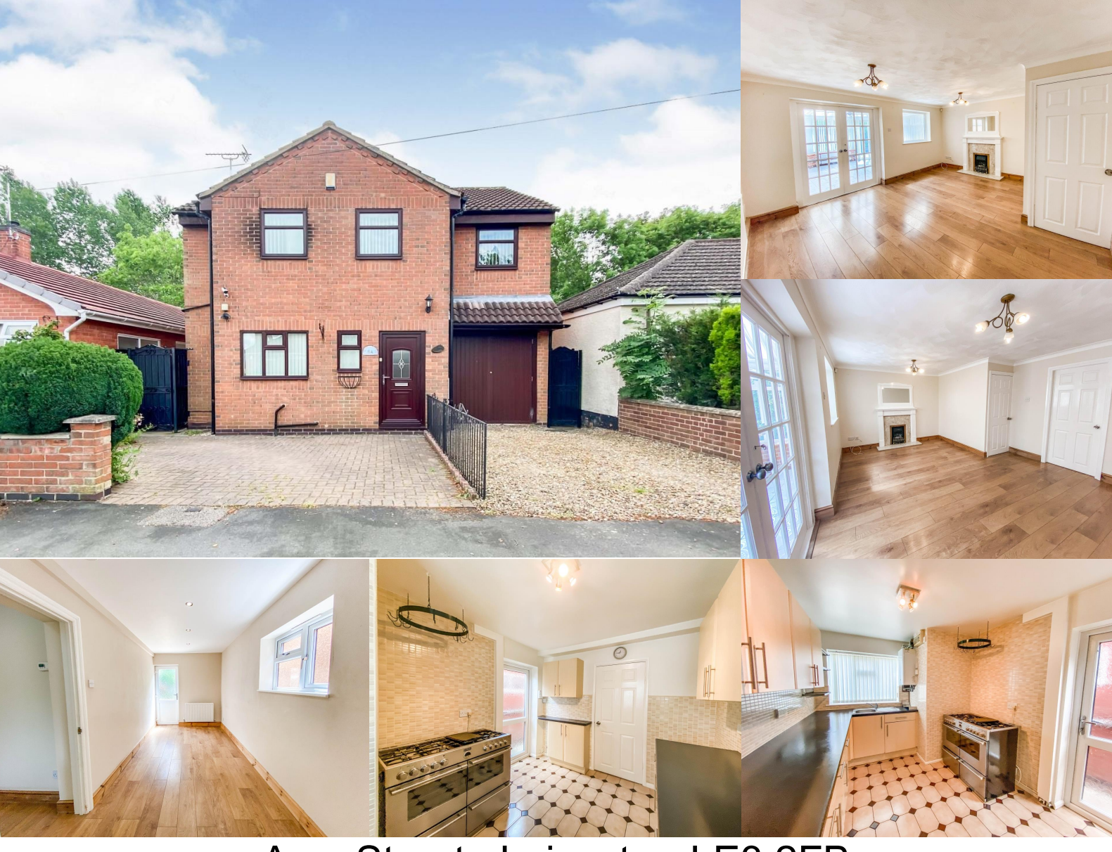
Amy Street , Leicester, LE3 2FB