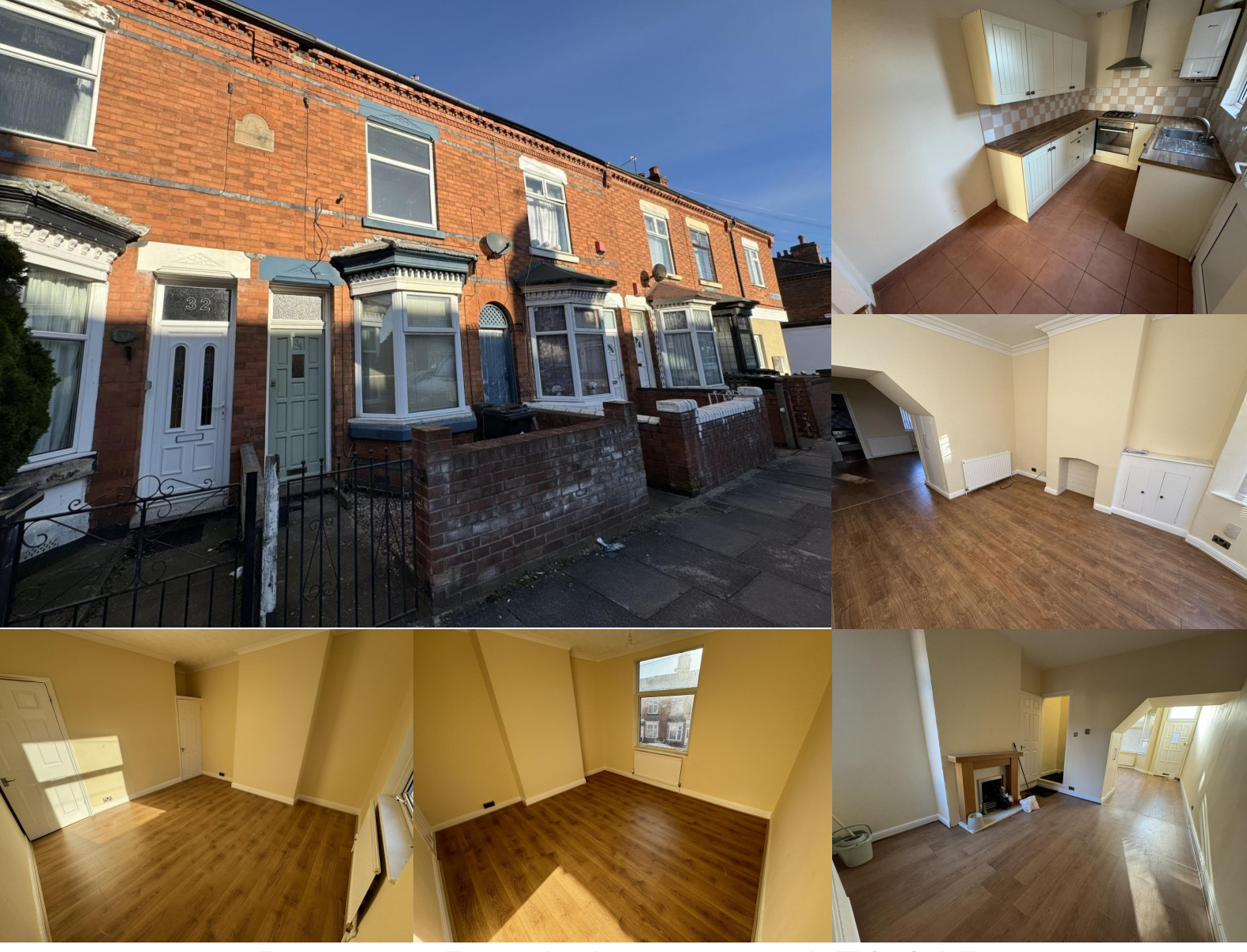
Danvers Road, Leicester, LE3 2AD