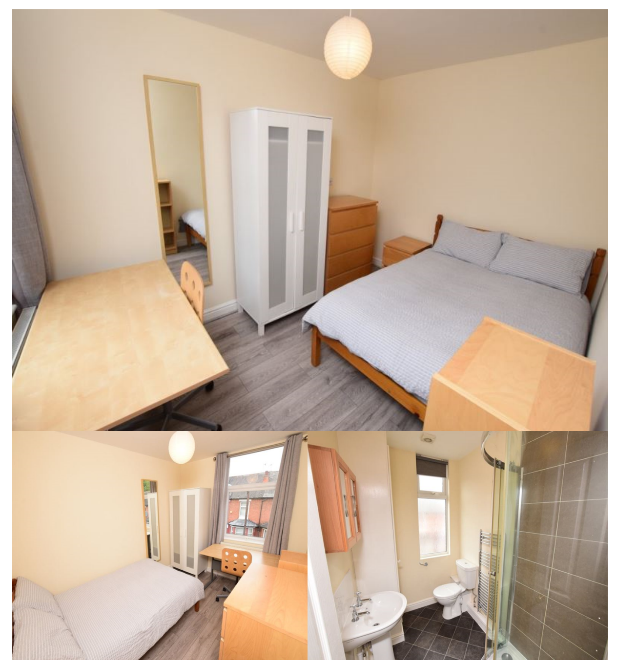
6 Bedroom House £2,998.26 pcm