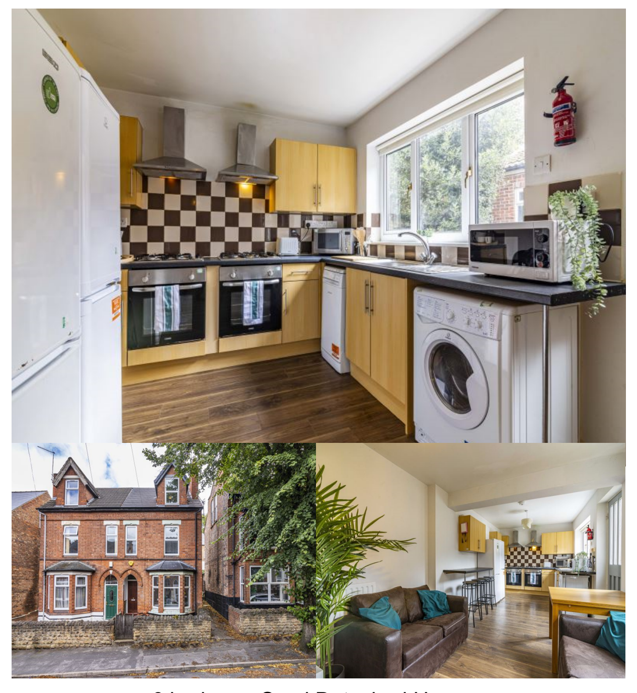
6 bedroom Semi Detached House £4,145.40 pcm