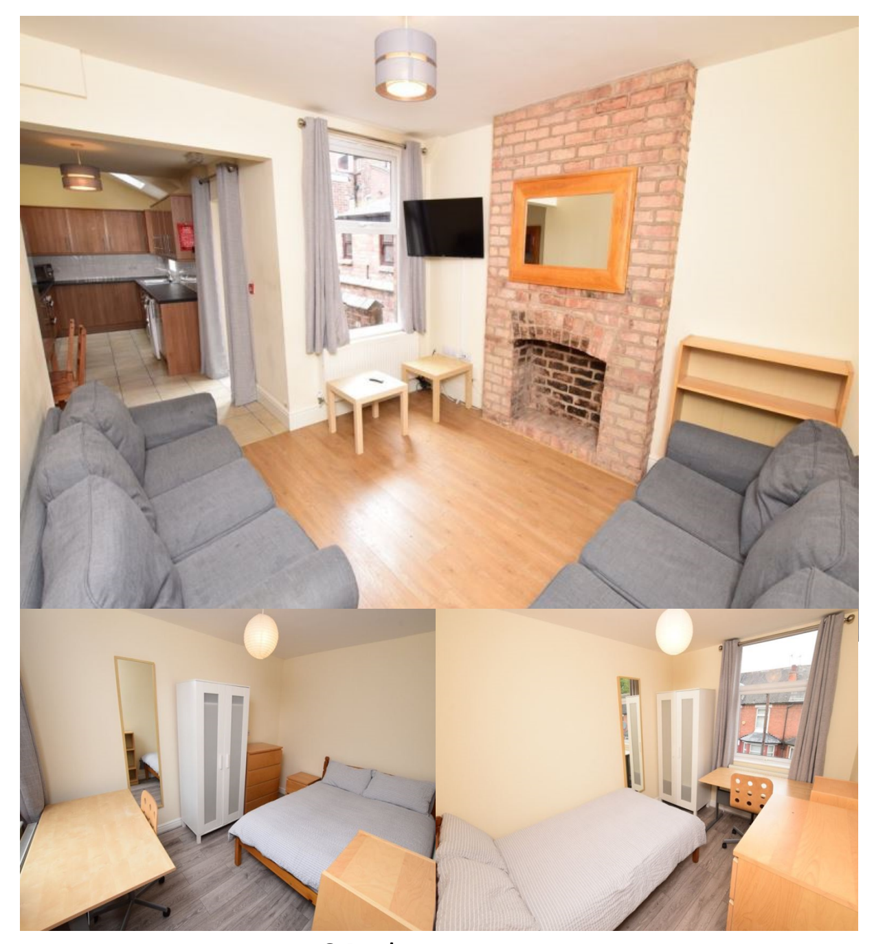
6 Bedroom House £499.71 pcm