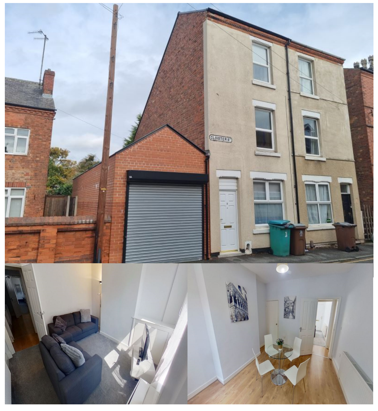
2 bedroom End Terrace House £1,209.38 pcm