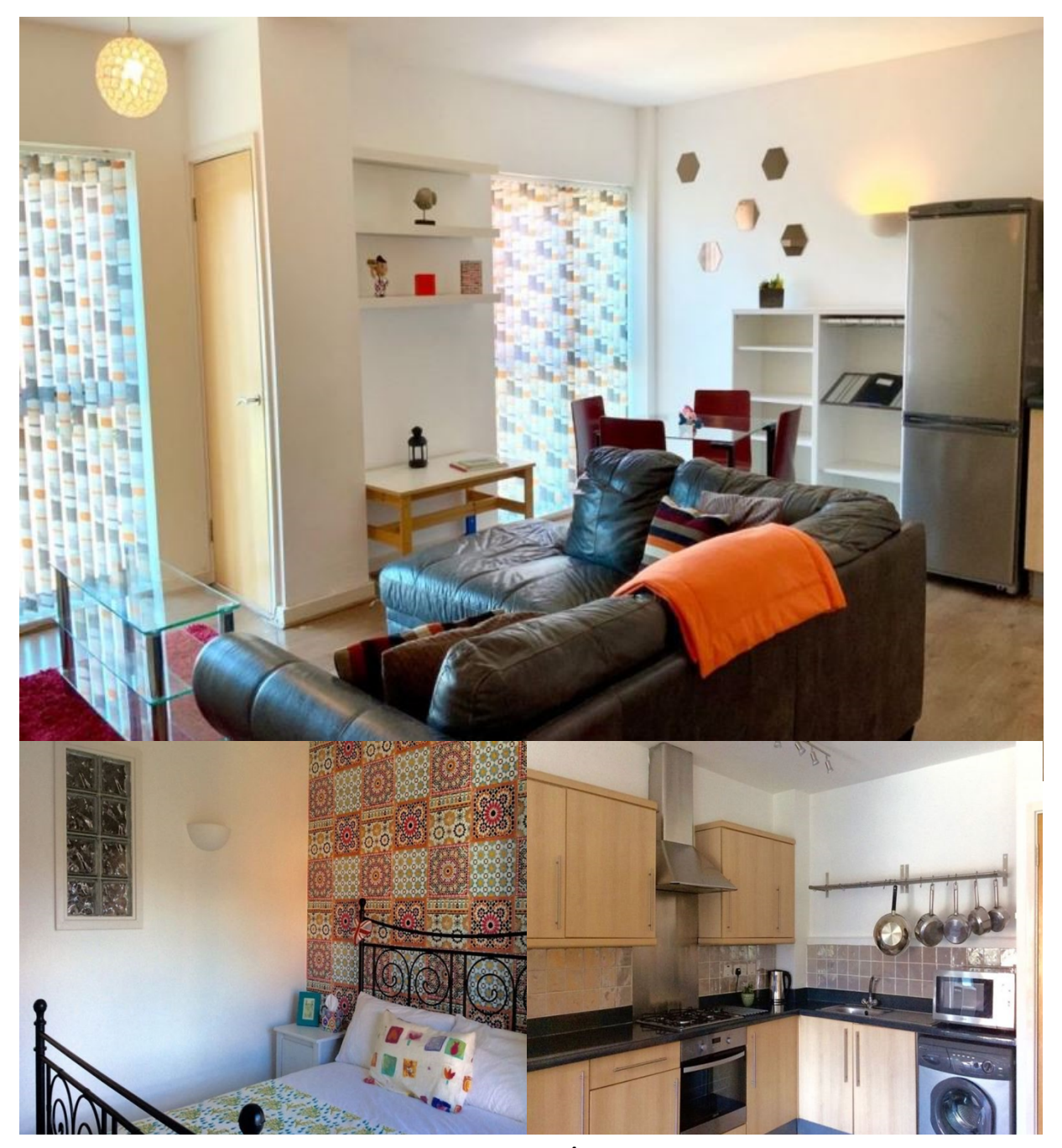
2 Bedroom Flat / Apartment £1,170 pcm