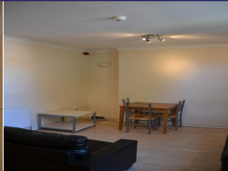
Rental £490 Monthly 4 Bedroom House Share Available Now