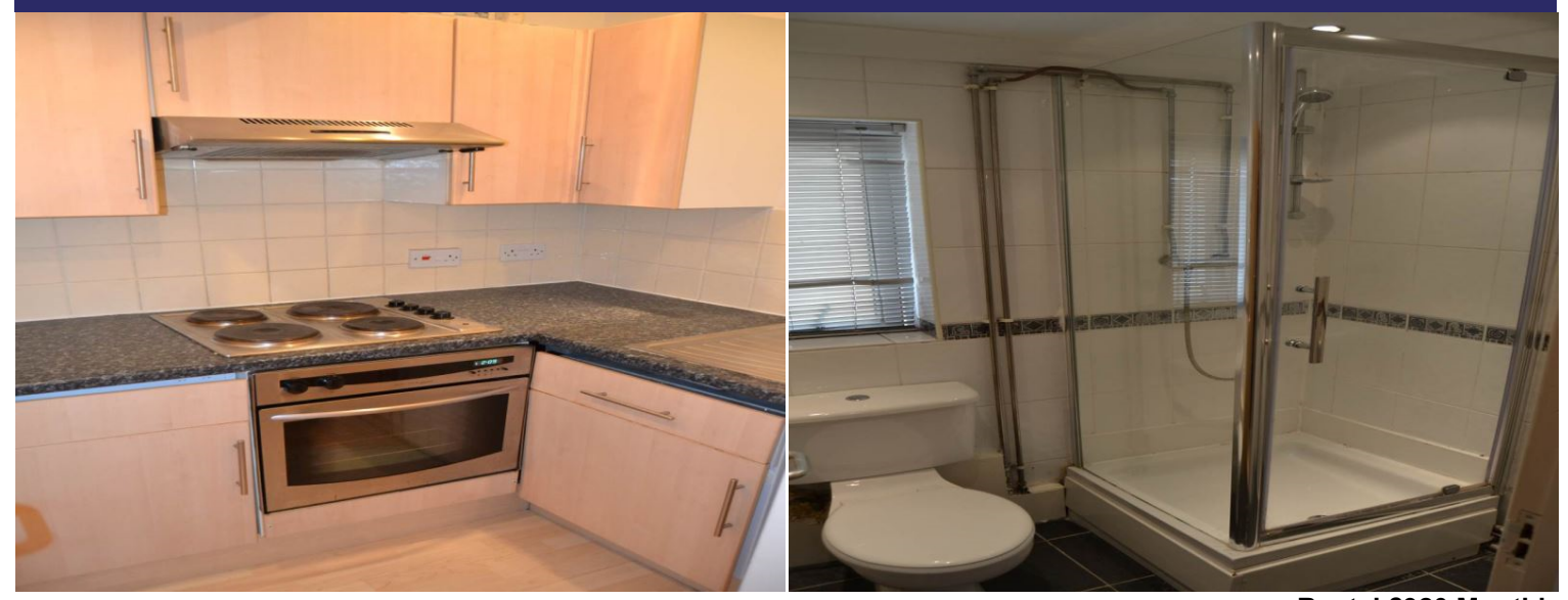
The Walk , Roath, Cardiff, CF24 3AF