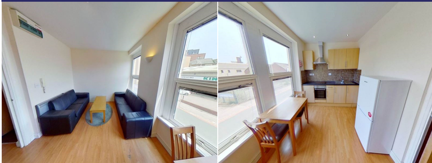
Penarth Road , Grangetown, Cardiff, CF10 5GP

Rental £1,410 Monthly 3 Bedroom Flat / Apartment Available 01 August 2025