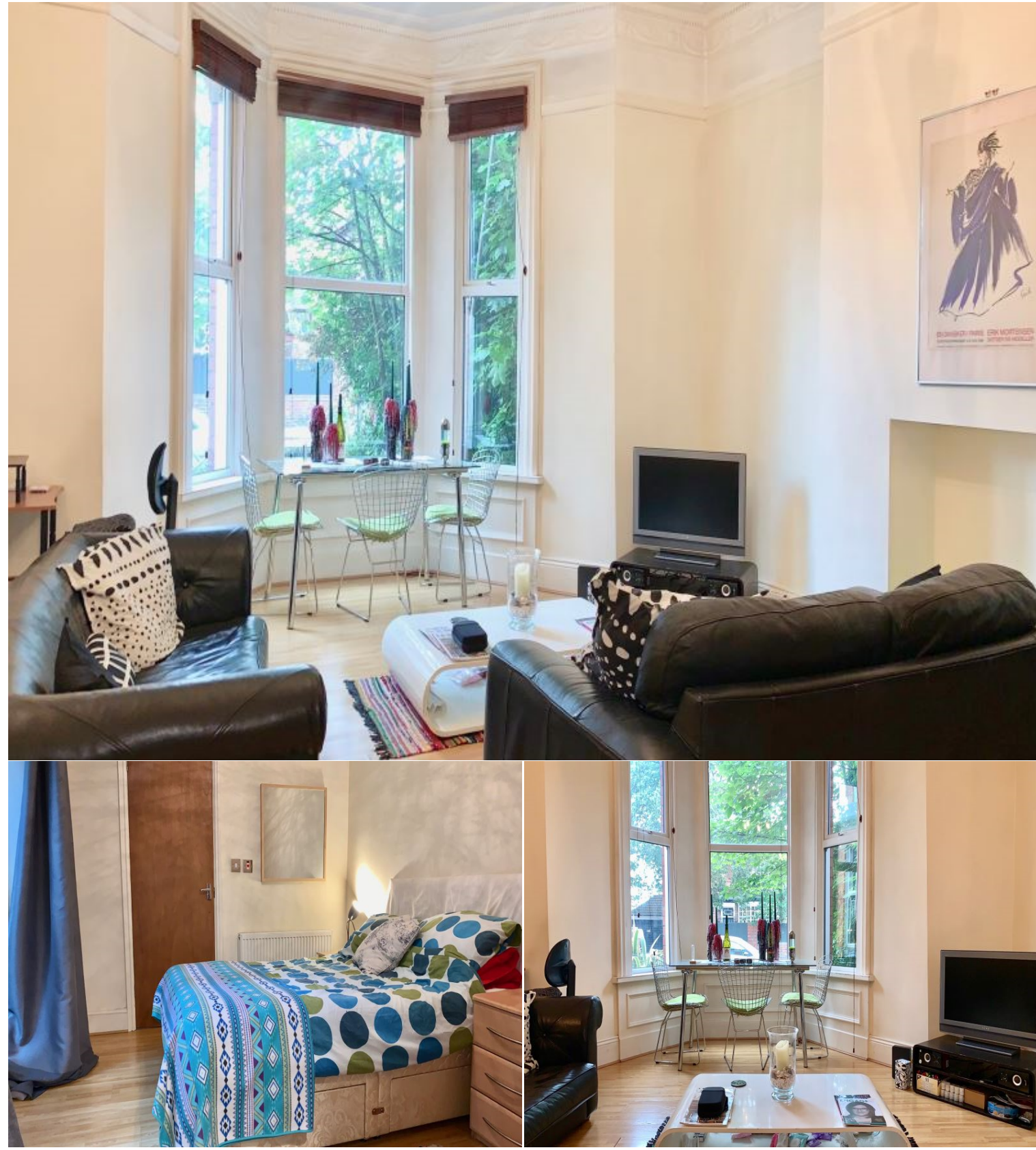
Osborne Road , Jesmond, Newcastle upon Tyne, NE2 2TA

Rental £1,400 Monthly 2 Bedroom Flat / Apartment Available Now