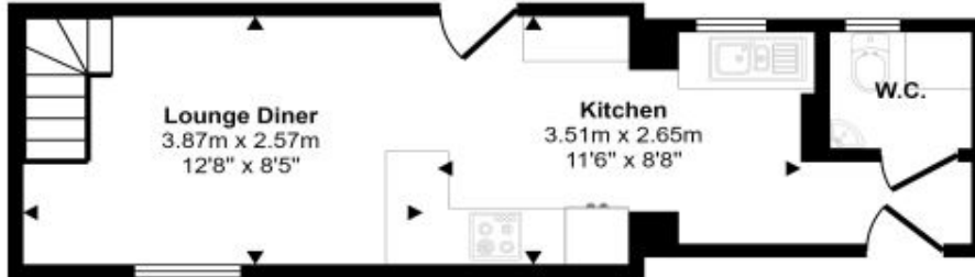
Ground Floor Approx 23 sq m / 244 sq ft

Approx Gross Internal Area 38 sq m / 406 sq ft