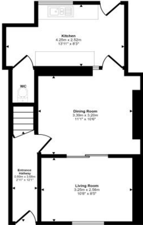
Ground Floor Approx 38 sq m / 412 sq ft

Approx Gross Internal Area 71 sq m / 768 sq ft