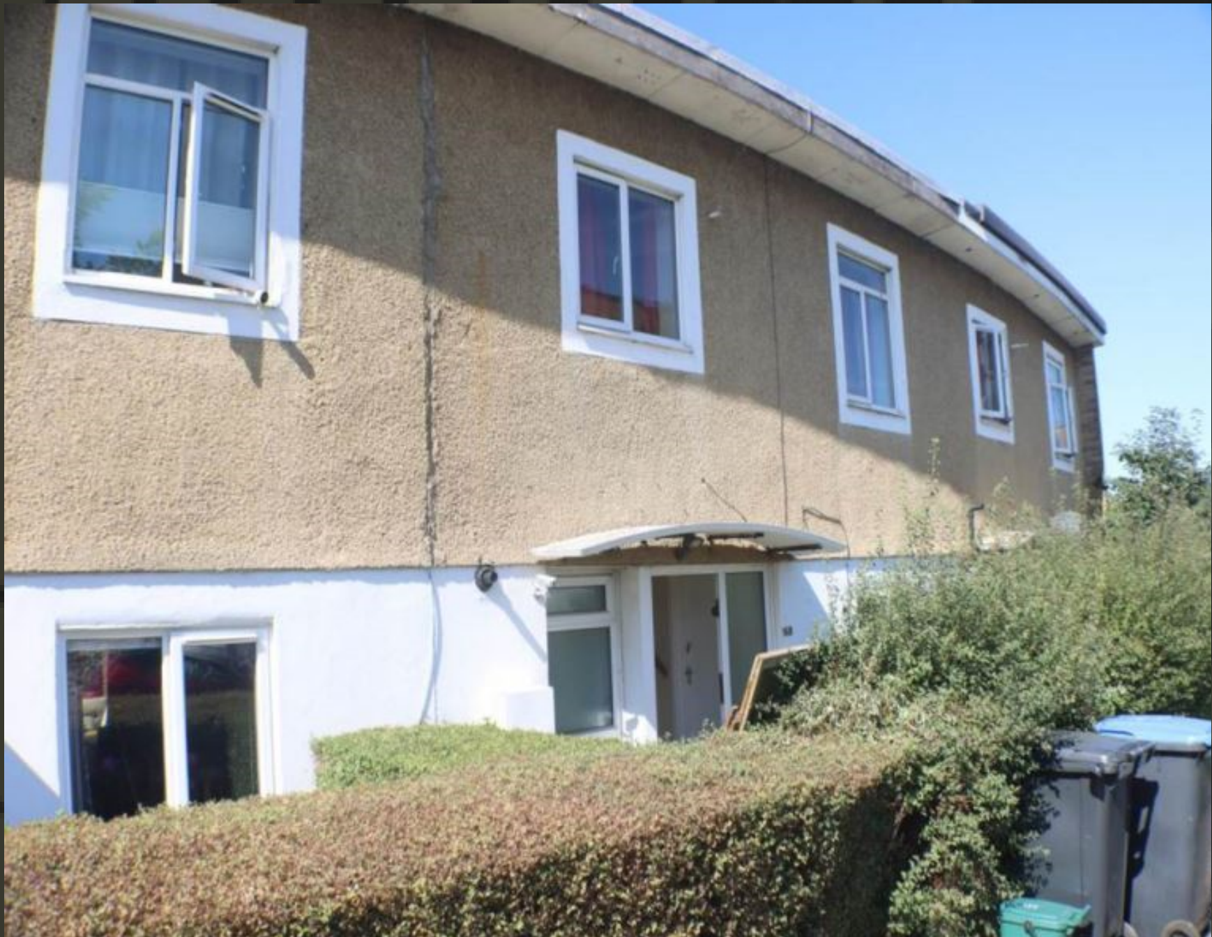
Bishops Rise, Hatfield, Hertfordshire