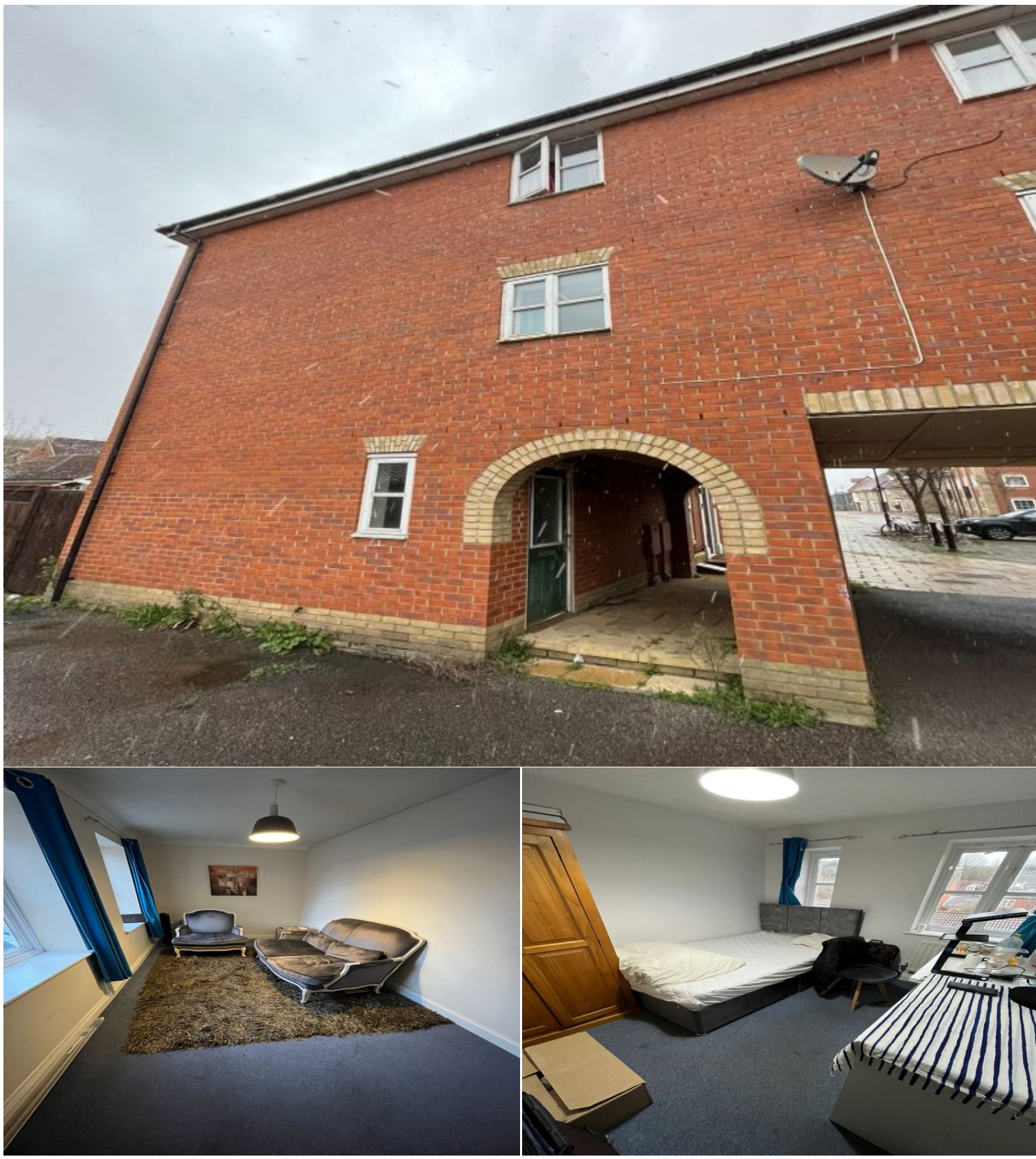
Hesper Road , Hythe, Colchester, Essex, CO2 8JR

Rental £2,200 Monthly 5 Bedroom House Available 01 September 2024