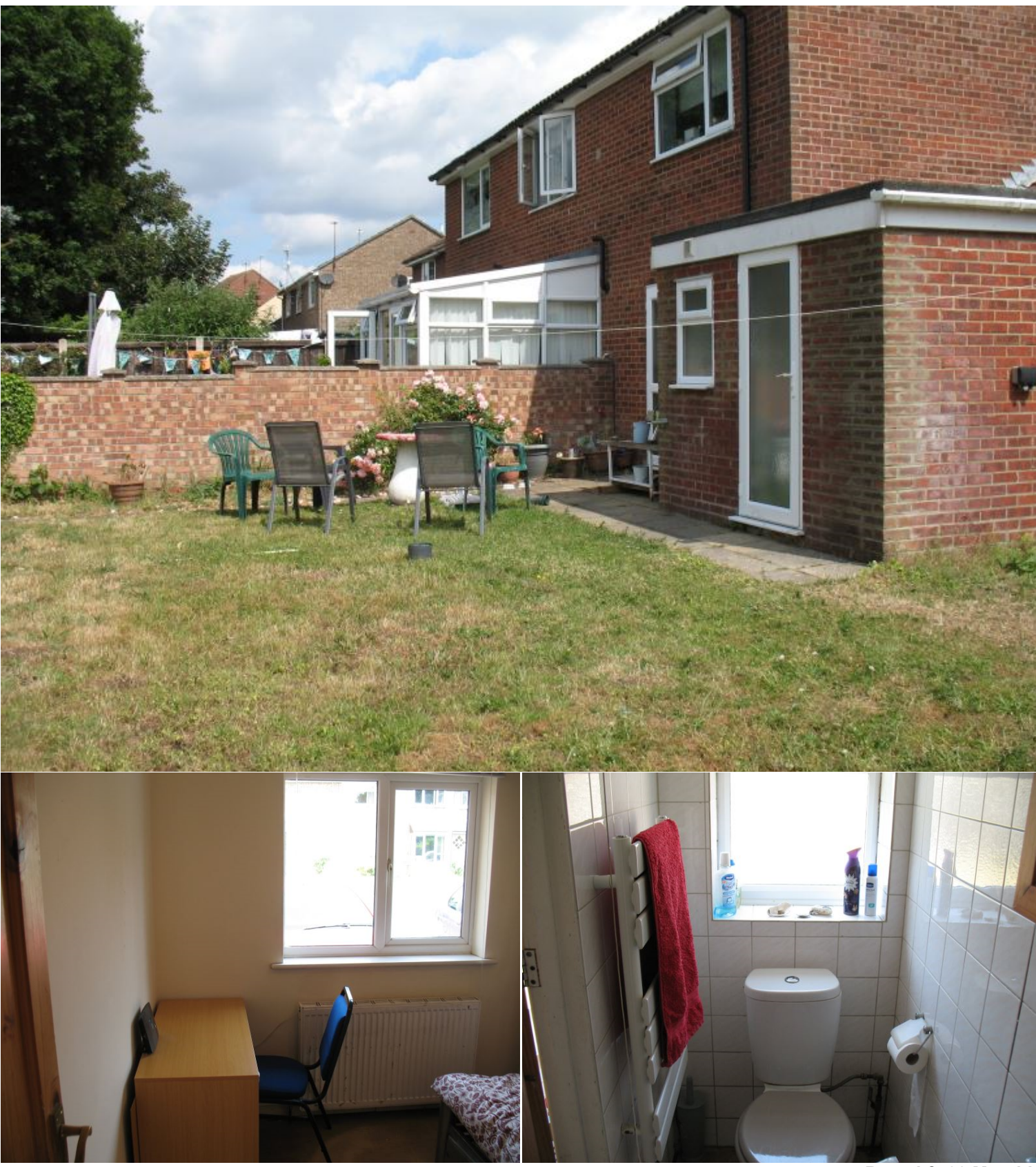
Henrietta Close , Wivenhoe, Colchester, Essex, CO7 9HF

Rental £500 Monthly 1 Bedroom House Share Available 01 August 2025