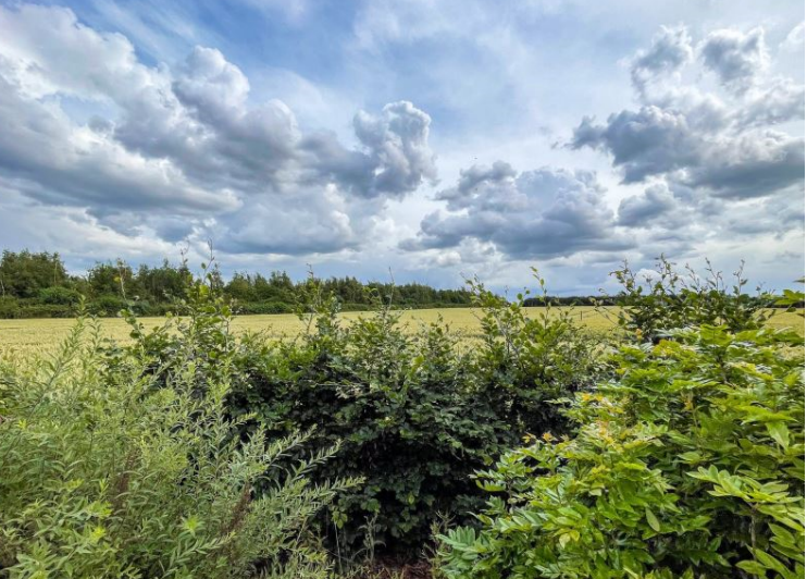
Toecroft Lane , Sprotbrough, Doncaster, DN5 7PQ